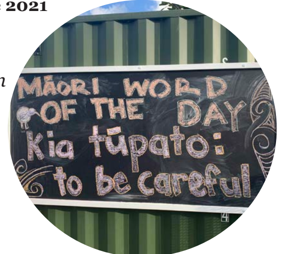
RAP blackboard sign, Sept 2020

We proudly present this Annual Report within the framework of RAP's Strategic Plan goals, following a truly challenging year for the Rānui community.