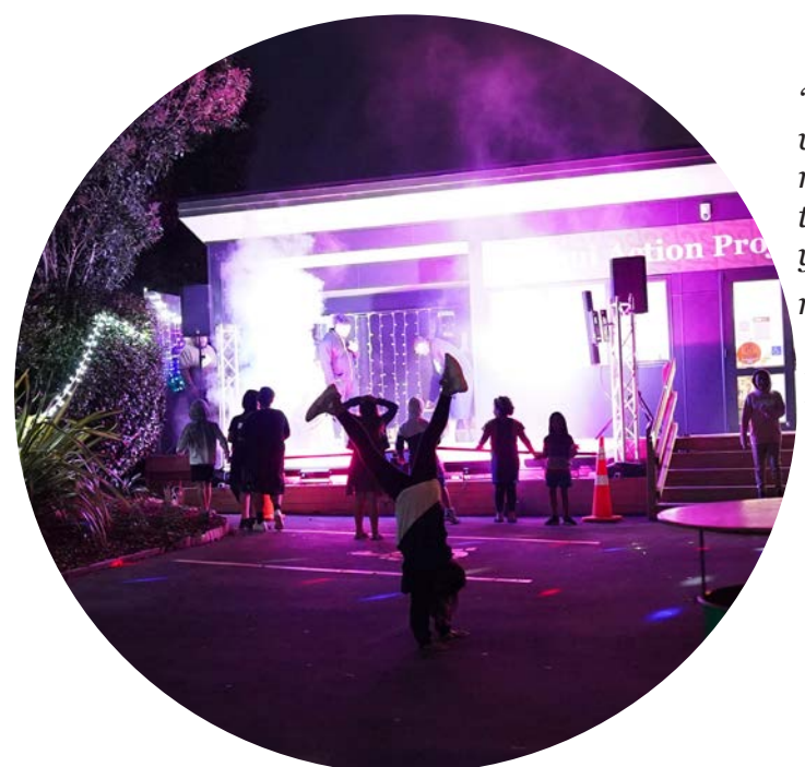
Rānui Youth Week Concert, May 2021

"Thank you all so much for hosting us yesterday, what a beautiful day and definitely the highlight of my year in the crazy! Love your new space, spending time with the Rānui family and really appreciative of your generous hospitality and allowing us to film the magic that is ACE in your hood."